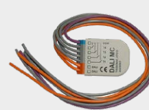
Switch Input 97-DALI-MC 6mA