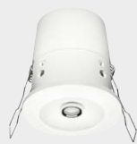
DALI Multisensor SR 97-5DPI_14RC 6mA