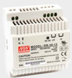
Control 3 PSU 97-C3-PSU LV supply for Processor

See Control3 Brochure for additional available components