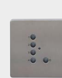
Scene Plate 97-12X-XXX 15mA