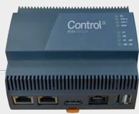
Control 3 Processor 97-C3CPU 1-8 Slices can be connected