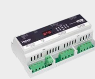
8x16A Relay 97-498 2mA