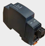
DALI Slice 97-SCIV2 64 addresses / 210mA